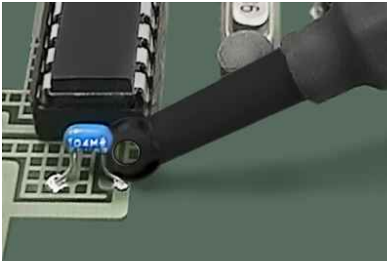
Application BS 05D