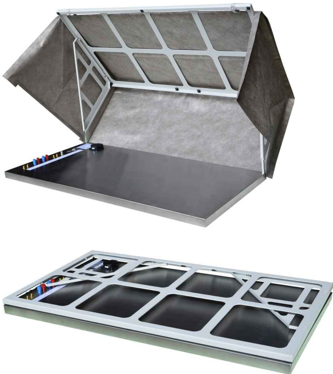
Opened shielding tent